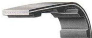
Dimension of Synchronous BeltXL